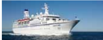
MS/ASTOR 176.5 metres long 23.6 metres wide 247 cabins Owner: TransOcean