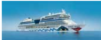
AIDAmar 252 metres long 32.2 metres wide 1,097 cabins Owner: AIDA Cruises