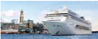
MSC Lirica 251.2 metres long 28.8 metres wide 780 cabins Owner: MSC Kreuzfahrten