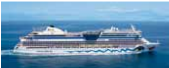
AIDAluna 252 metres long 32.2 metres wide 1,025 cabins Owner: AIDA Cruises

They are the uncontested stars of the Hamburg Cruise Days: the seven impressive ocean liners that will be calling in on the Port of Hamburg from 17 to 19 August 2012 to captivate and fascinate spectators along the waterfront. A special highlight is the grand Hamburg Cruise Days Parade on Saturday evening, where several cruise ships will be departing, one after the other, on their journey down river to the sea, accompanied by countless boats and barges.