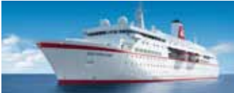
DEUTSCHLAND 175 metres long 23 metres wide 294 cabins Owner: Reederei Peter Deilmann GmbH