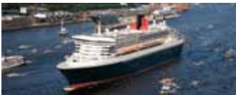
Queen Mary 2 345 metres long 41 metres wide 1,310 cabins Owner: Cunard Line