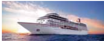
MS COLUMBUS 2 180.4 metres long 25.7 metres wide 349 cabins Owner: Hapag-Lloyd Kreuzfahrten