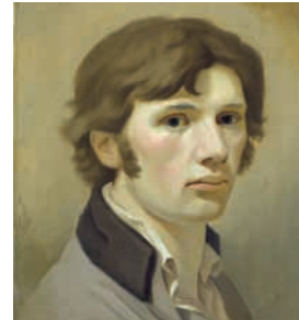
Philip Otto Runge (1777–1810). Self-portrait with brown collar, 1802.

Kosmos Runge. The Morning of Romanticism 3 Dec 2010–13 Mar 2011