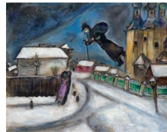
Marc Chagall, Above Vitebsk, undated

Marc Chagall. Life Lines 8 Oct 2010–16 Jan 2011